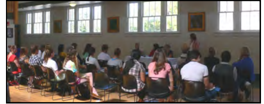
PANELISTS ADDRESS THE AUDIENCE DURING THE DISCUSSION ON FEMINIST SCHOLARSHIP AND THE ENVIRONMENT

The audience, consisting of students, faculty and staff from across the university, questioned the panel on how they could help local efforts and global sustainability.