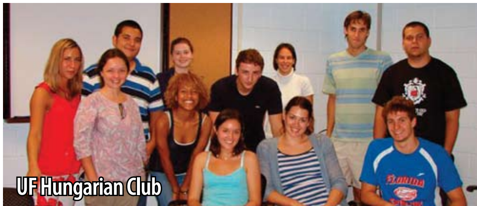
UF Hungarian Club

Earlier this year a group of students decided that UF was lacking in Hungarian representation. They banded together to form the UF Hungarian Club which meets twice a month on Tuesdays.