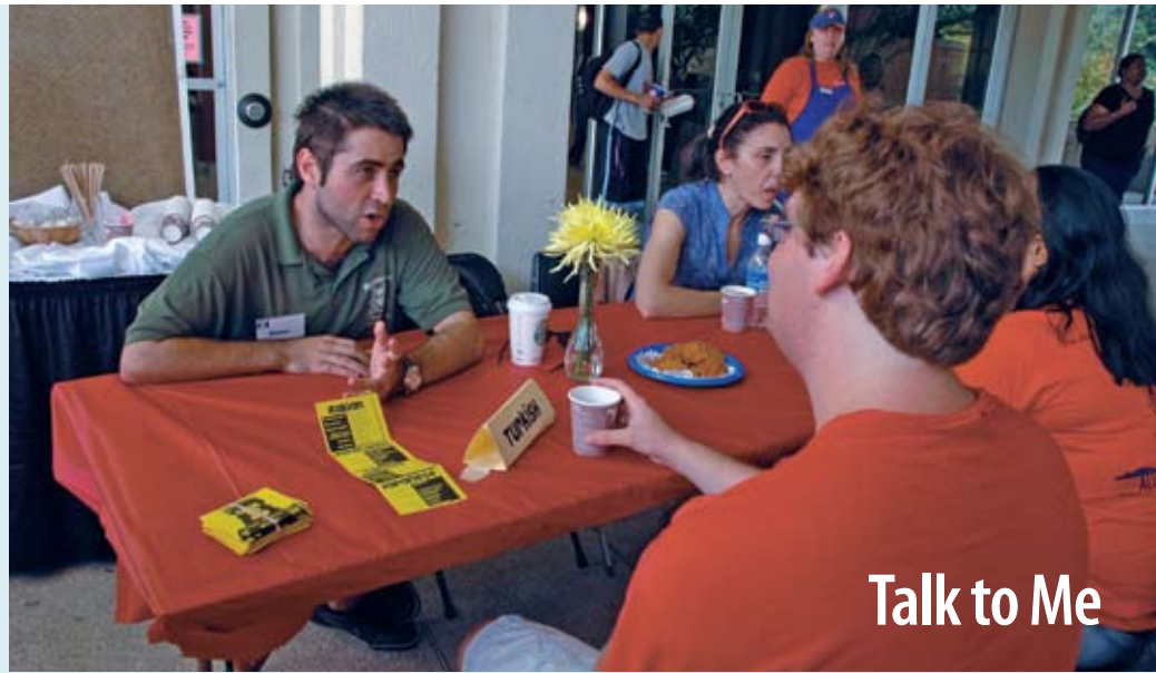
Talk to Me

The Fall 2008 semester included three talks in the Graduate Student Brown Bag Series , "ARM or FRM: Which Mortgage