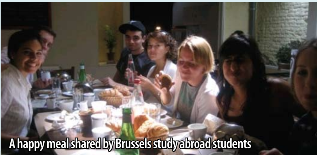
A happy meal shared by Brussels study abroad students

You will make lifelong friends, see Europe's most beloved cities and monuments, live and study in a foreign country at a foreign university taught in English by UF and Vesalius faculty, and leave with memories encapsulated in photographs and souvenirs. Simply put, studying abroad in Brussels will change your life. It changed mine. Despite all of the things I did—and especially ate—in Europe, I returned home hungry for more.